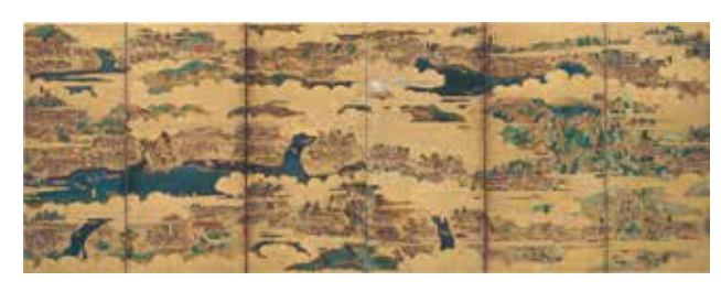
Pair of Folding Screen of the Tökaidö (right-hand screen of a pair of sixfold screens), Edo period, Shizuoka City

In the Edo period, travel became popular as a result of the maintenance of highways, and a number of paintings produced featuring Tōkaidō, a major highway linking Edo (current-day Tokyo) and Kyoto. Suruga Province has been a rich environment of natural beauty and historical interest, exemplifying a spot overlooking Mount Fuji. This makes Suruga an essential location for paintings of Tōkaidō. Focusing on the landscape of Suruga, this exhibition features the abundant world of travel and landscape, through artwork including Folding Screen of the Tōkaidō, and the Hōeidō edition of Fifty-Three Stations of the Tōkaidō by Hiroshige Utagawa. Tōkaidō also made it possible to connect Suruga's intellectuals of refined taste with artists in Kyoto and Edo. To revisit the art and culture of Suruga cultivated along Tökaidö more broadly, the exhibition also features artworks by Kōkan Shiba, and the school of Ōkyo Maruyama.