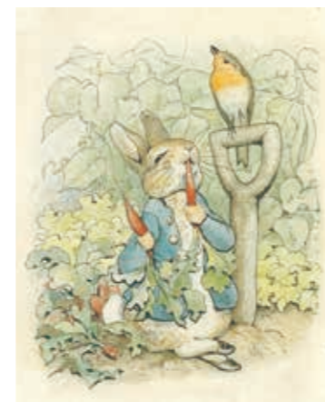
Illustration from The Tale of Peter Rabbit , 1902, The Warne Archive c/o Frederick Warne & Co. © Frederick Warne & Co. Ltd., 2017

In association with Frederick Warne & Co. PETER RABBIT™ "BEATRIX POTTER" © Frederick Warne & Co., 1902 Frederick Warne & Co. is the owner of all rights, copyright and trademarks in the Beatrix Potter character names and illustrations. Licensed by Frederick Warne & Co. Ltd. All Rights Reserved.